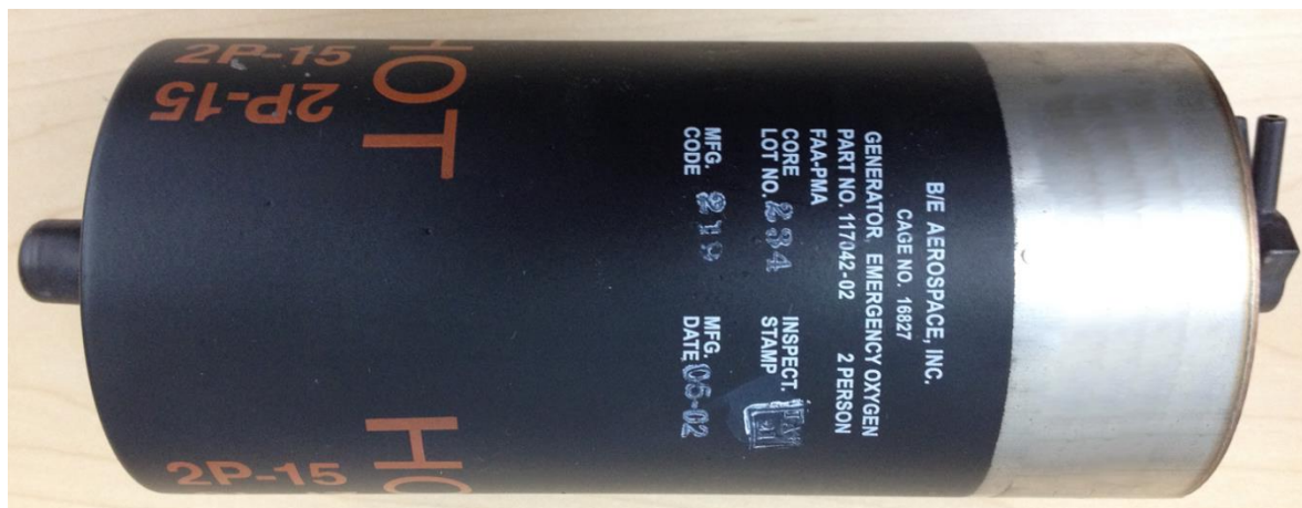
Figure 2 – MFG.DATE (05-02 = May 2002) example